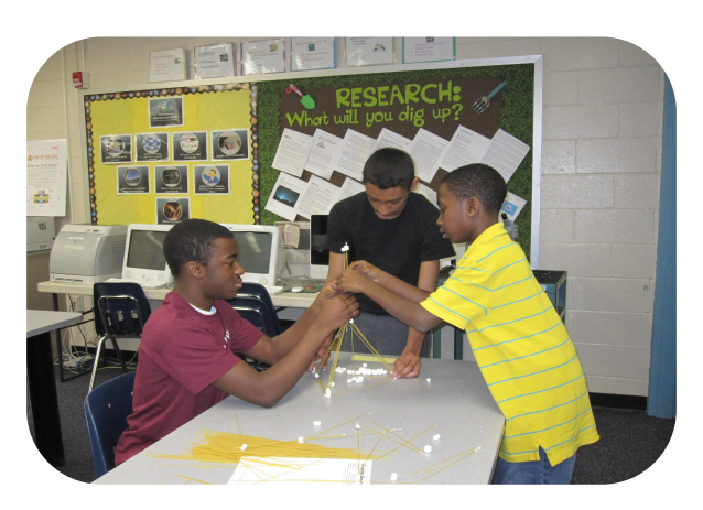
Open to All Interested Students