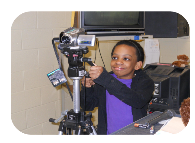
Creative Production or Inquiry